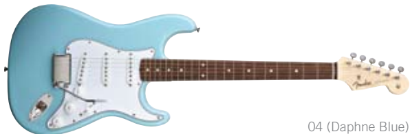
04 (Daphne Blue)