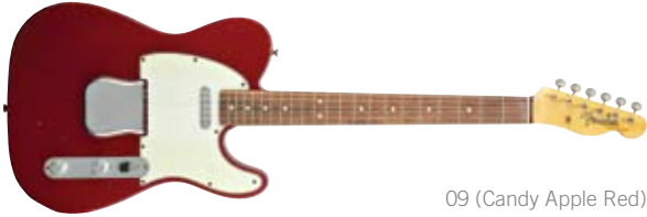
09 (Candy Apple Red)