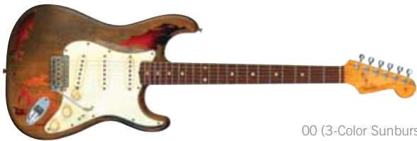
00 (3-Color Sunburst)

The Rory Gallagher Stratocaster guitar is an exact representation of the Irish blues singer/songwriter's personal instrument and features three custom wound '60s single-coil pickups, aged chrome hardware, 21 jumbo frets and a bone nut. We take extra detail during the Relic® process to replicate Gallagher's extremely worn Three-color Sunburst alder body, maple neck and rosewood fingerboard. We've even gone as far as to include five Sperzel® tuners and one Gotoh® tuner, as well as replacing the twelfth dot marker with white plastic instead of the original clay.