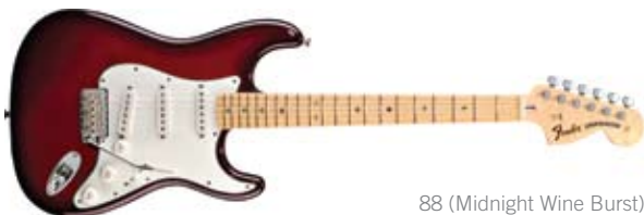
88 (Midnight Wine Burst)

In 1974, legendary solo artist and Procol Harum guitarist Robin Trower helped define an era of guitar-riff rock with the first four notes of "Bridge Of Sighs." A long-time Stratocaster player, Robin's signature guitar features a custom pickup set created by Robin and Fender® Master Builder Todd Krause. The pickup set provides multiple classic Strat® tones, and the "reverse wound/reverse polarity" middle pickup, which includes a humbucking option in the second and fourth positions. Other features include an alder body, custom "C"-shape maple neck with a large '70s-style headstock, abalone dot position inlays with narrow spacing, '70s-style decal without "Synchronized Tremolo," bullet truss rod adjustment nut and four-bolt neck plate.