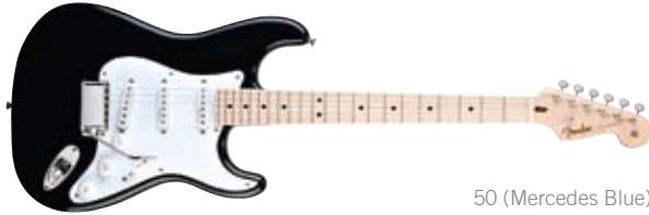
50 (Mercedes Blue)