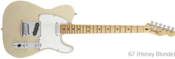
67 (Honey Blonde)