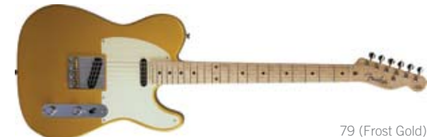
79 (Frost Gold)