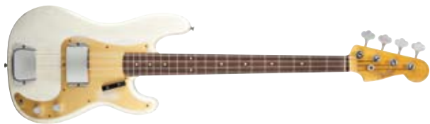
07 (Vintage Blonde)