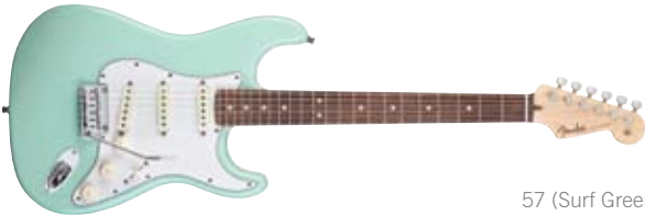
57 (Surf Green)