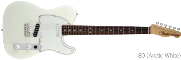
80 (Arctic White)