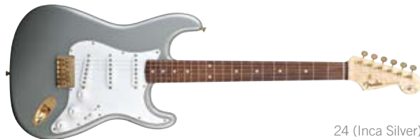
24 (Inca Silver)