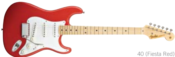
40 (Fiesta Red)