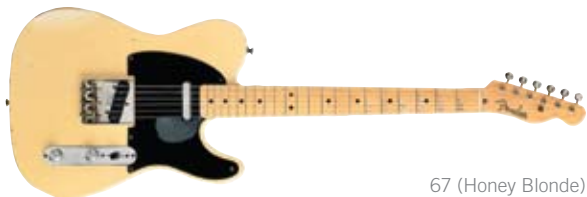
67 (Honey Blonde)