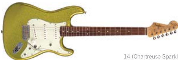
14 (Chartreuse Sparkle)

The Dick Dale Stratocaster guitar honors the pioneer of surf guitar, and his unique sound and playing style. Features include an alder body, special shape maple neck with reverse headstock, rosewood fingerboard, three Custom '50s pickups with special switching, master volume control and original synchronized tremolo.