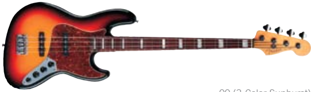
00 (3-Color Sunburst)