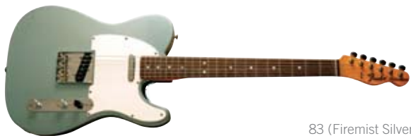
83 (Firemist Silver)