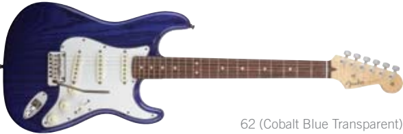
62 (Cobalt Blue Transparent)