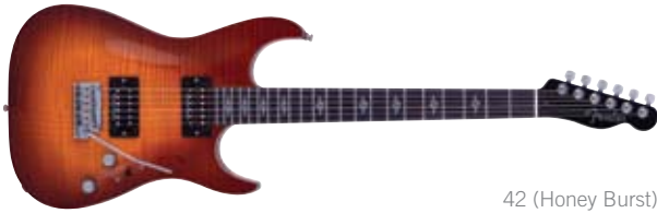
42 (Honey Burst)