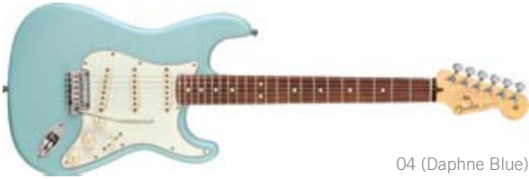
04 (Daphne Blue)