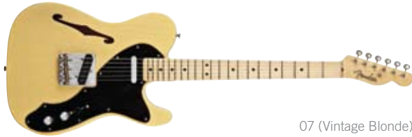
07 (Vintage Blonde)