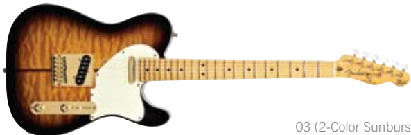
03 (2-Color Sunburst)