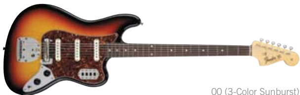
00 (3-Color Sunburst)