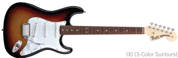
00 (3-Color Sunburst)