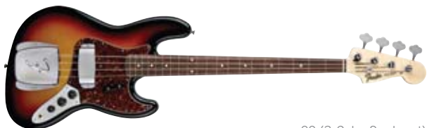
00 (3-Color Sunburst)