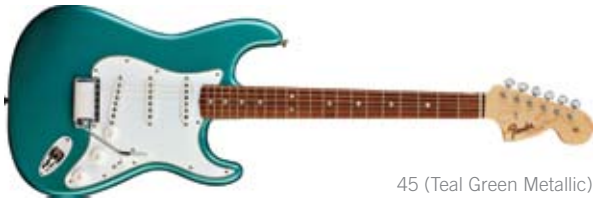
45 (Teal Green Metallic)