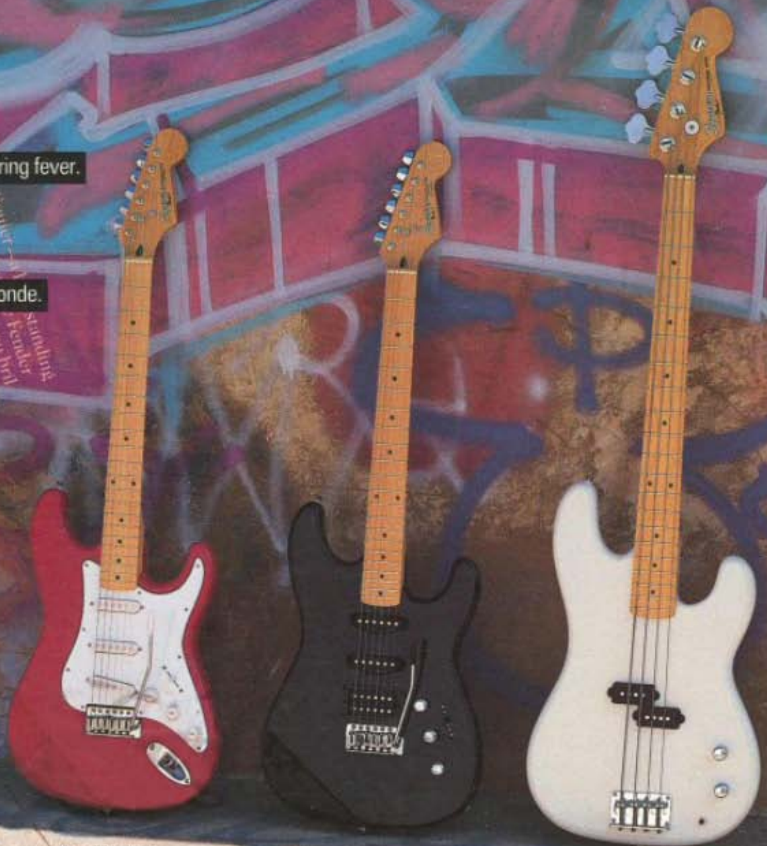
Squier II Standard Strat in Torino Red

is brilliant sound, superior playability and solid, dependable quality. These instruments offer the combination and exceptional value. Nothing else in their class even comes close!