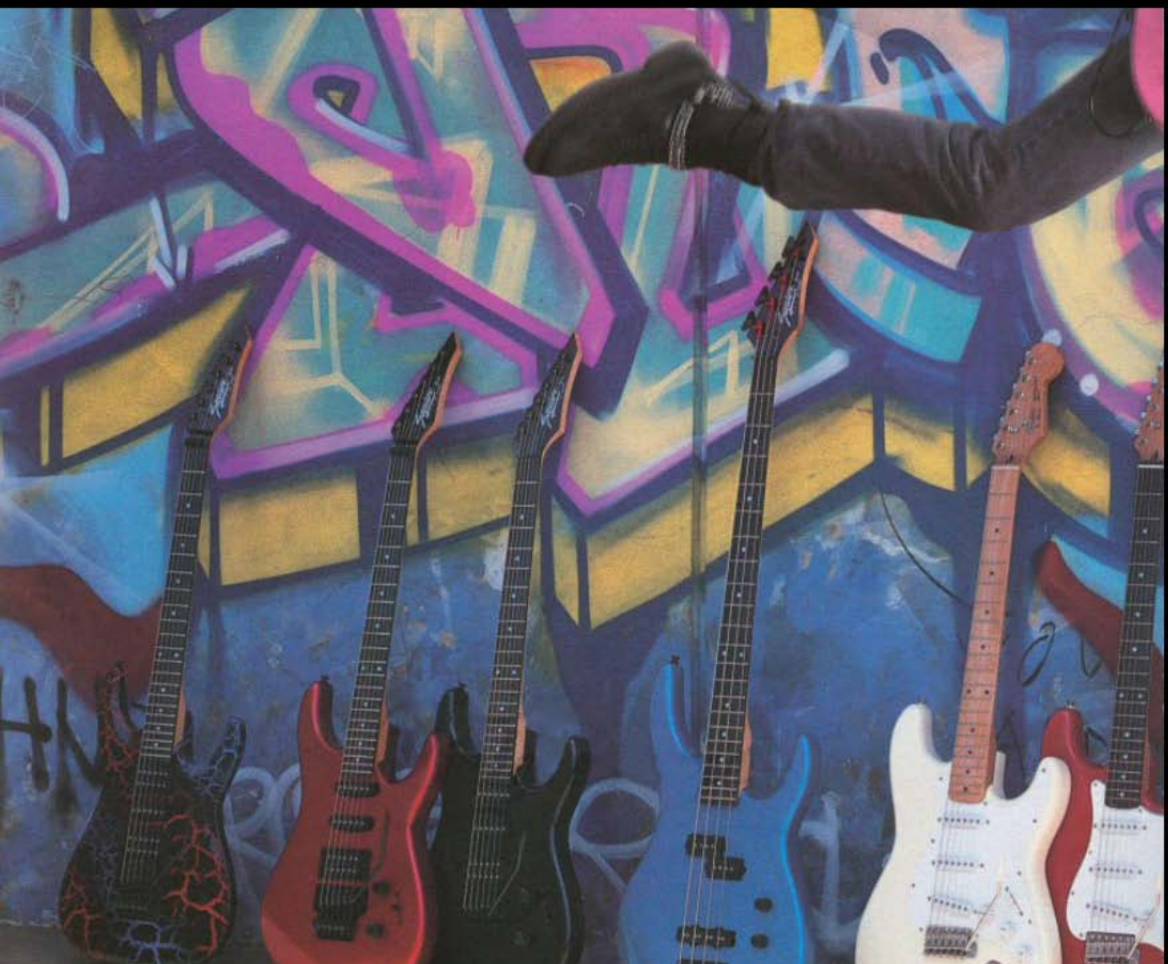
H.M. III in Crackle